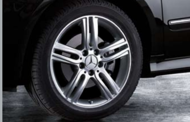
Bokhan | 5-twin-spoke wheel

Judge for yourself which of the incenio designer wheels shown on this page would result in the most breathtaking look for your own B-Class.